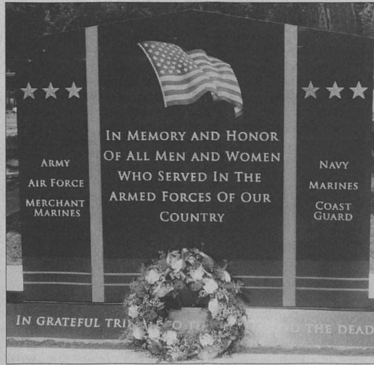
Sheridan Cheatham Cemetery Association dedicate a large beautiful black granite monument that contained all of the engraved names of the honored veterans buried at Cheatham Cemetery.

* Always grill in a well-ventilated area, away from eaves and overhangs that can trap toxic fumes.